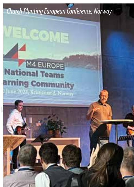
Church Planting European Conference, Norway