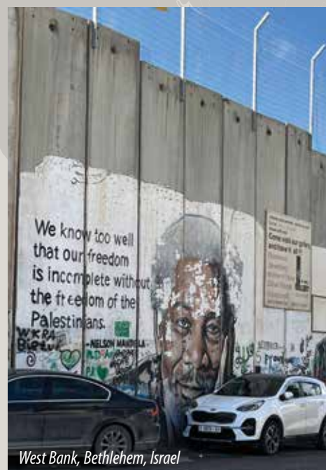
West Bank, Bethlehem, Israel