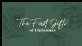
The First Gifts of Christmas