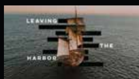
Leaving The Harbor