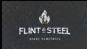
Flint & Steel

In Ministry Year 2023, we came together for relevant Bible teaching across all our locations during these 12 sermon series.