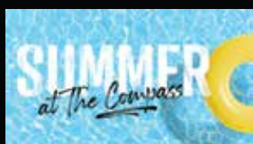
Summer at The Compass