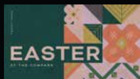
Easter at The Compass