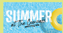
Summer at The Compass