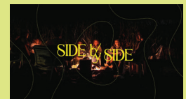
Side by Side